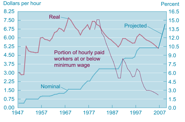
FIGURE 1 FEDERAL MINIMUM WAGE AND WORKERS AT OR BELOW IT